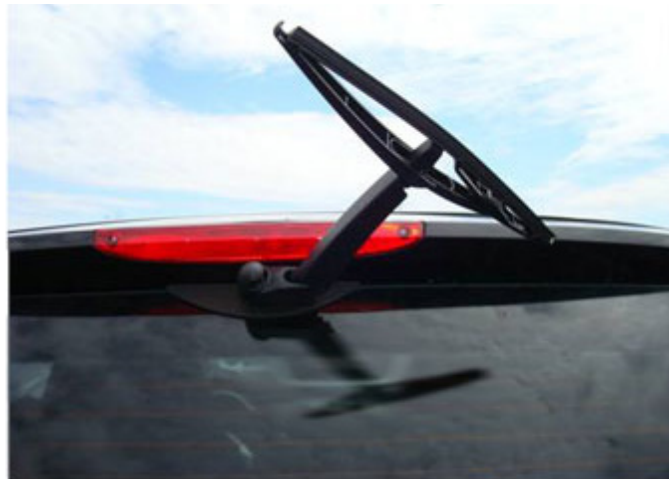
FIGURE B - FRONT WINDSHIELD WIPER