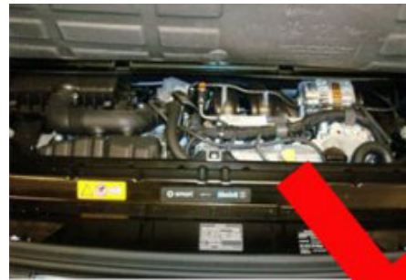
FIGURE A - ENGINE COMPARTMENT