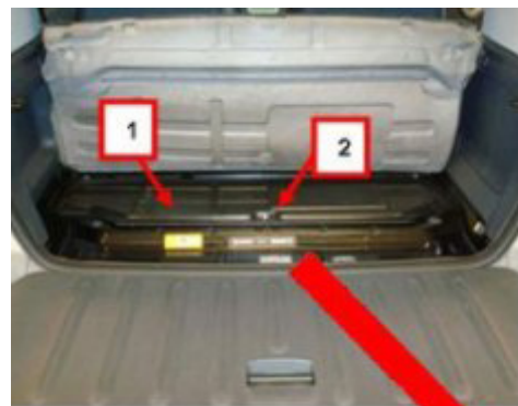
FIGURE A - REAR TRUNK AREA