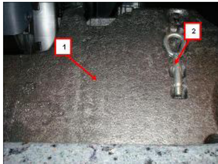
FIGURE A - PASSENGER FOOT WELL